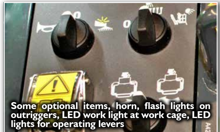
Some optional items, horn, flash lights on outriggers, LED work light at work cage, LED lights for operating levers