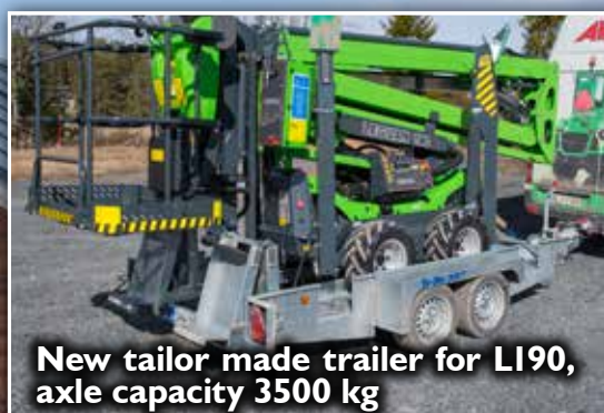
New tailor made trailer for L190, axle capacity 3500 kg