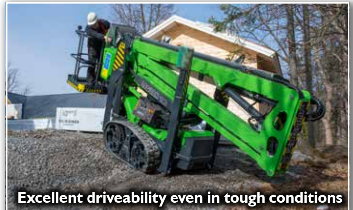
Excellent driveability even in tough conditions