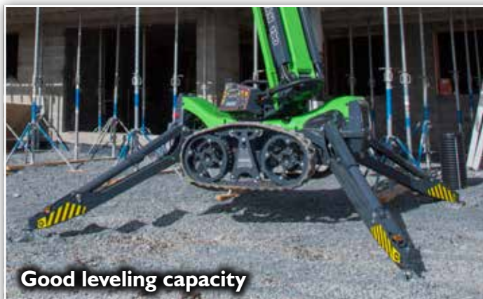
Good leveling capacity