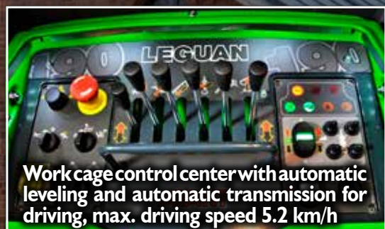
Work cage control center with automatic leveling and automatic transmission for driving, max. driving speed 5.2 km/h