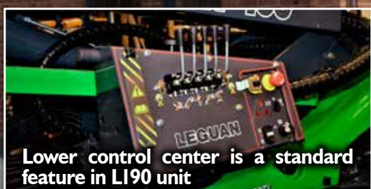
Lower control center is a standard feature in L190 unit